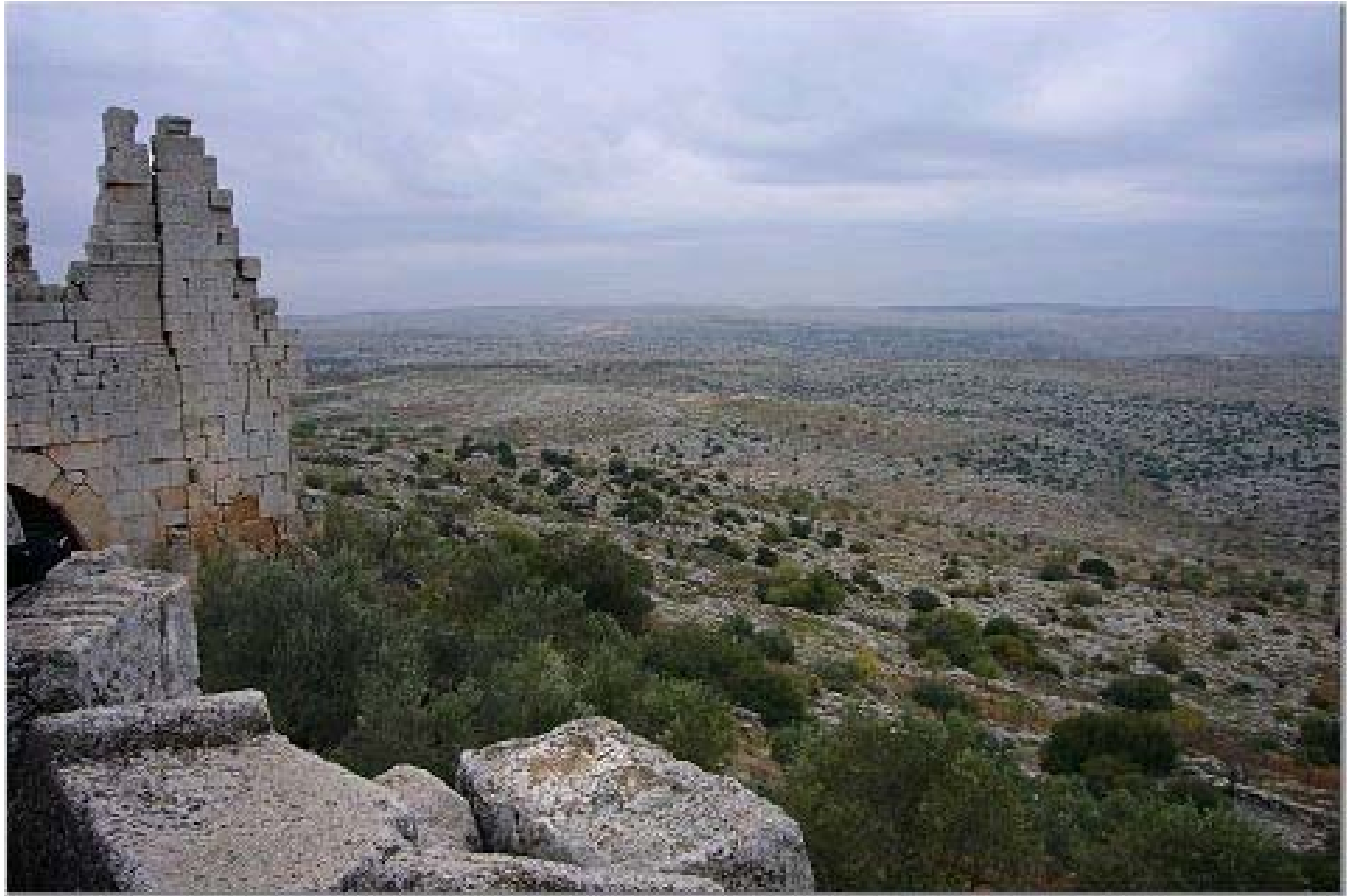
A view of the Dead Cities and surrounding countryside in Syria