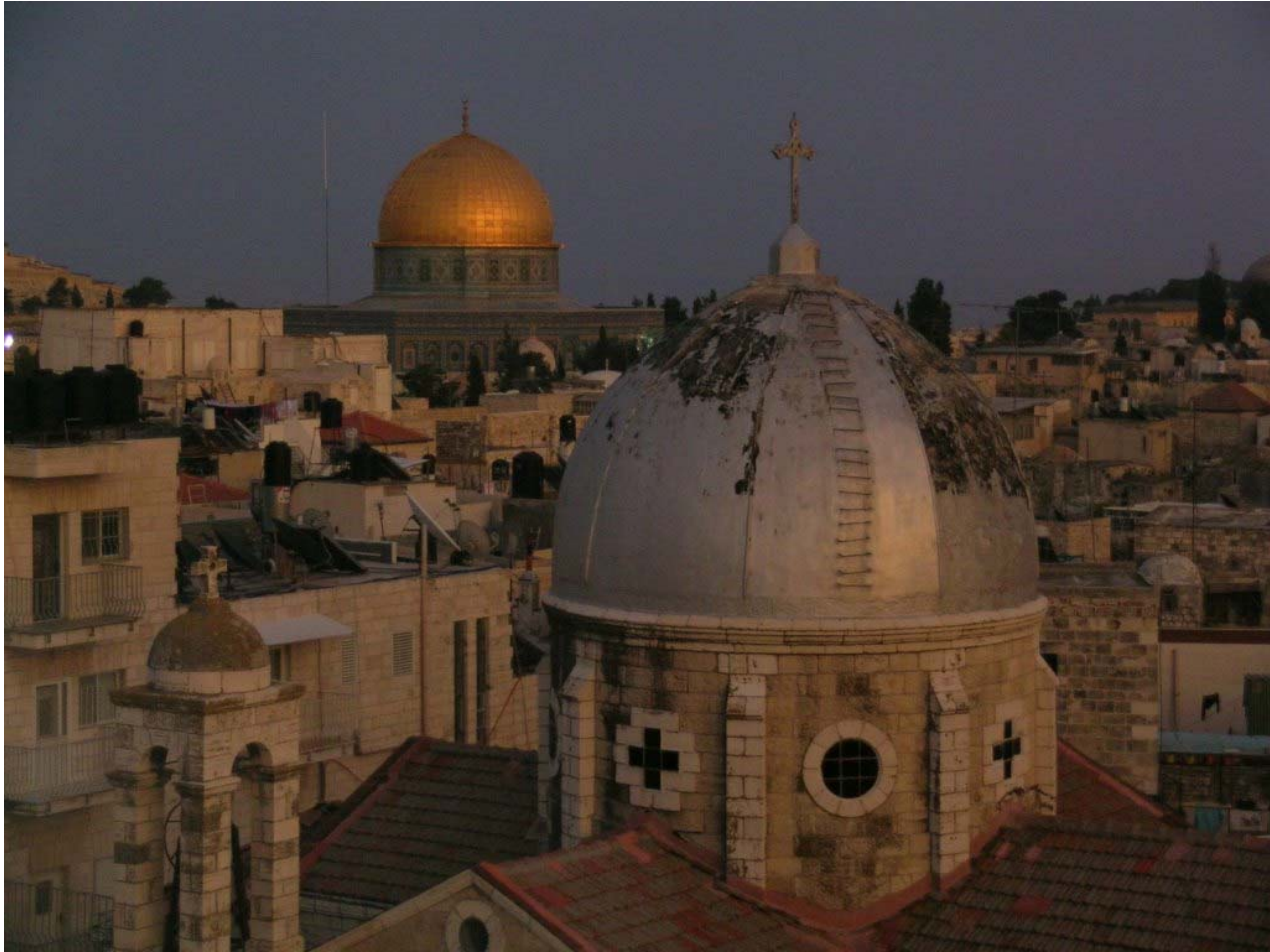
Looking across to the Dome of the Rock in Jerusalem