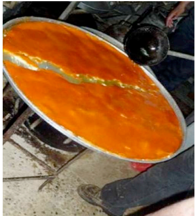
NABLUS FAMOUS KNAFEH

DIVIDE UP TO HAVE DINNER AND STAY WITH FAMILIES.