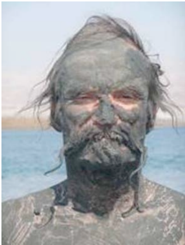
DEAD SEA EXPERIENCE!

LOOKING FOR SOMETHING OUT OF THE ORDINARY, SOMETHING THAT WILL CHANGE THE WAY YOU SEE THE MIDDLE EAST?