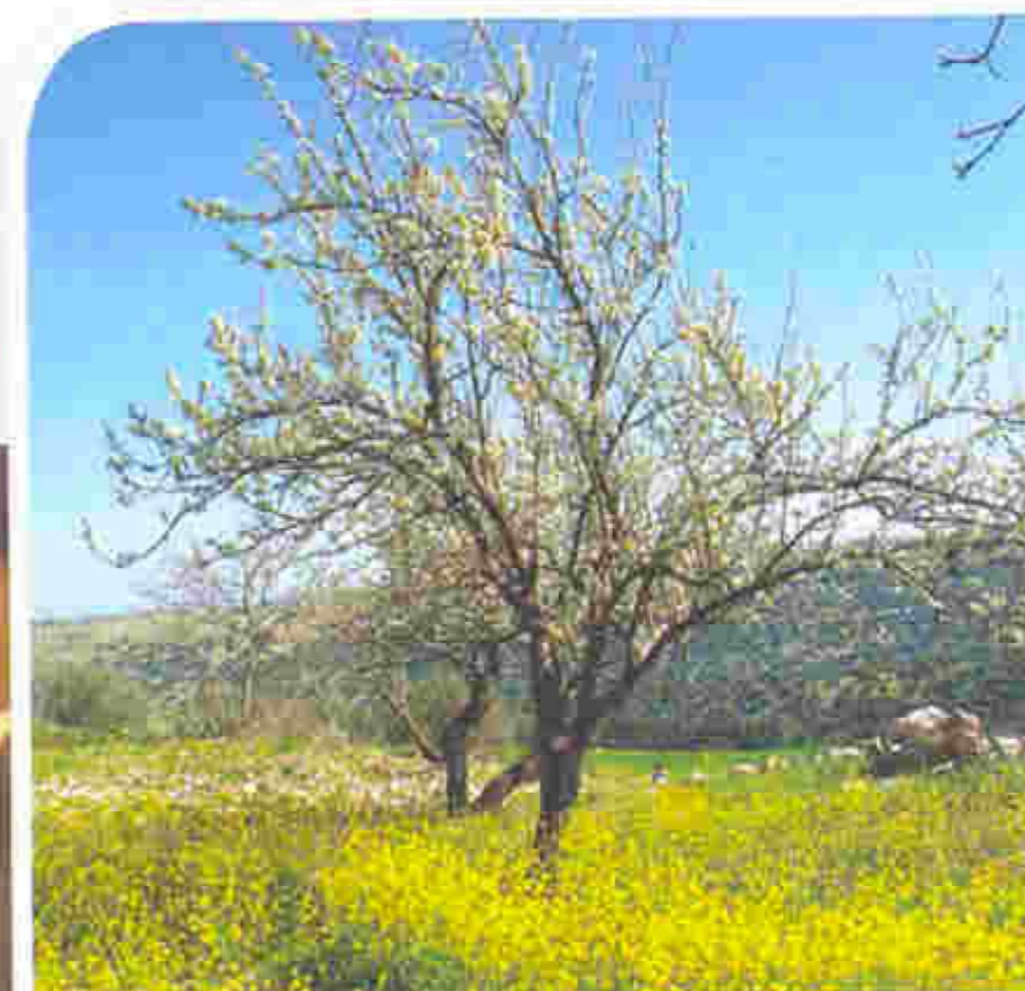
It is the culture of a pilgrim rather than a tourist